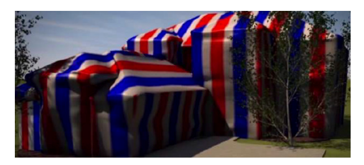
Figure 3: Fumigation tent

When entire buildings get fumigated, usually a risk area of 10m around the building gets fenced off. The risk area is defined as area or space, where the fumigant gas has been applied and where the gas may move to. With other words: The area, where the gas is a potential threat to fumigators and others. The fumigation area has always to be sealed from other areas and made as gas tight as possible. Only the fumigator-in-charge can give permission for entering this danger area, in case of emergency such as fire. Therefore, he must be aware of the actual concentrations, which means there must be a real-time gas monitor.