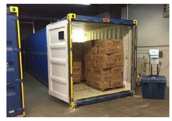
Figure 1: AirWatch GasPod for Shipping Container Measurement

The AirWatch, as a semi-fixed gas monitor, offers the solution. Just contact your distributor for the special designed Fumigation AirWatch. The Fumigation AirWatch is available in 2 versions: With an 8-day-battery-GasPod or the eco-friendly solar-power version, which runs for weeks and months. You can choose between your preferred fumigant. The AirWatch offers sensors, which are designed for long time monitoring in high concentrations.